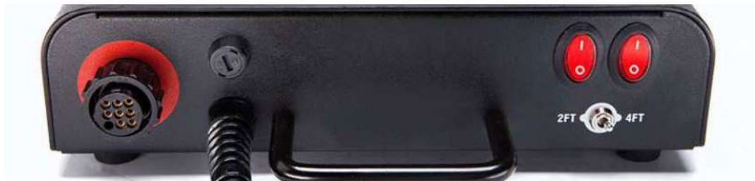
Double Ballast (Model BAL-227 Controls View)

The Kino Flo Double ballast is a high output, high frequency electronic ballast with universal input voltage from 100-240VA operate two lamps (4ft or 2ft) up to 75 feet between ballast and fixture. The ballast sends a high output current to the lamp light as brightly as possible. Its high frequency electronics prevent any type of flicker as well. Custom electronic engineering operation without magnetic hum or cooling fans to interfere with the sound recording on set.